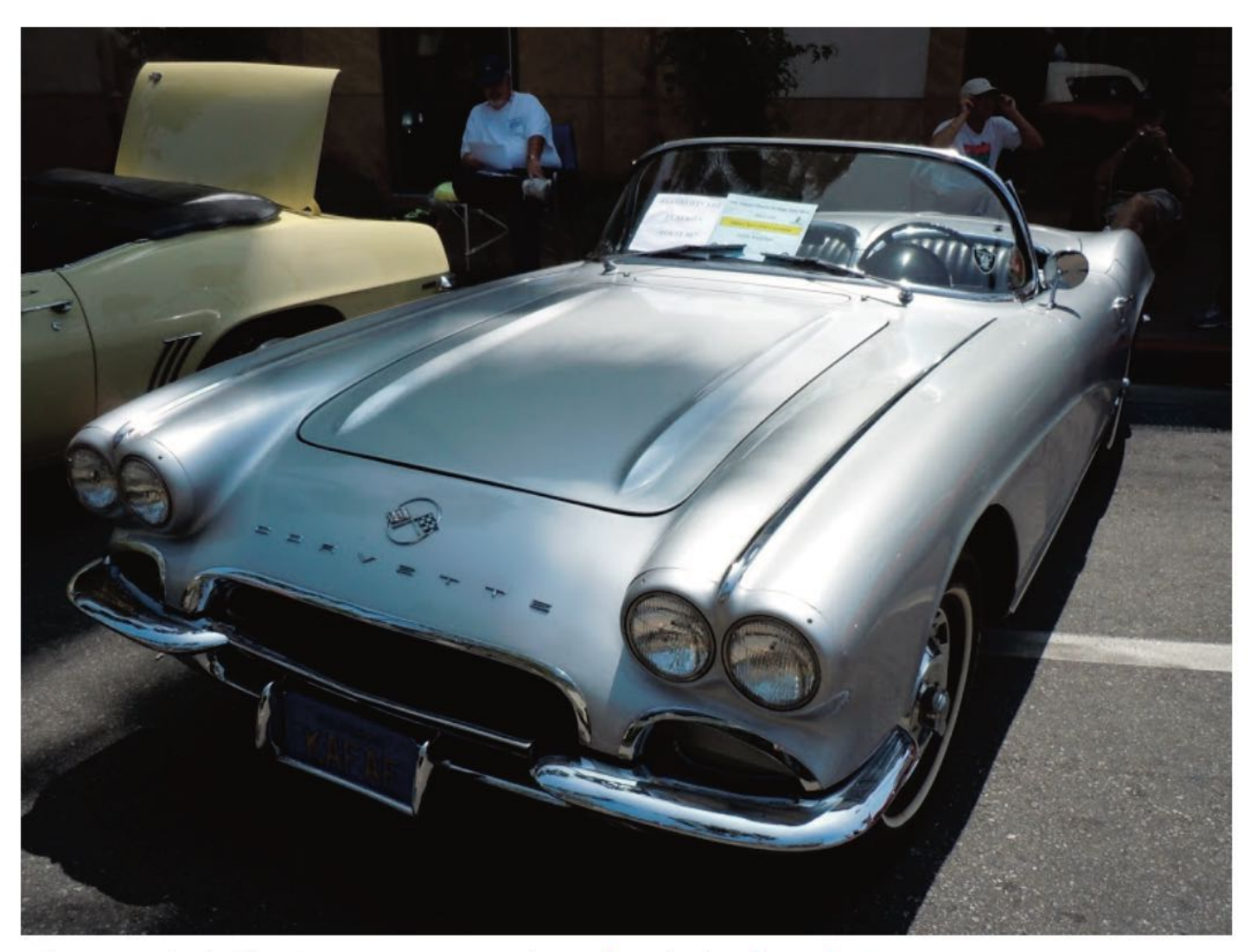
*The original* sky blue Route 66 Corvette, the perfect shade of gray for TV