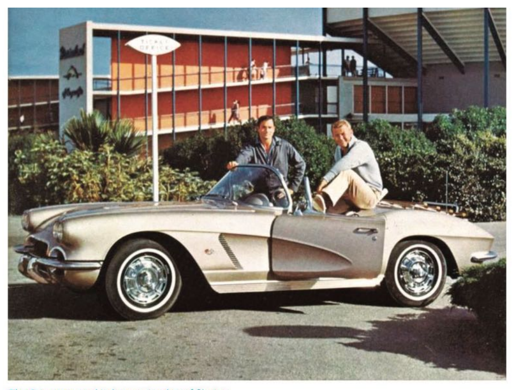
The Corvette used in later episodes of filming.

If you see who's driving the Corvette in every scene, you can figure out that it's Tod's car. But how did he get it?