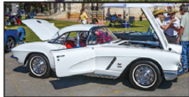
< Tim Wardlaw 1963 Best of Show C1-C4 Dale Davis 2017 Best of Show C5-C7 >