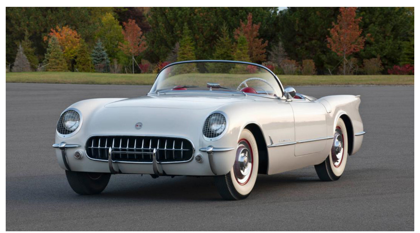
The original Corvette from 1953 remains an American icon, but in 1955 it really came into its own with a V-8 under the hood.

But true to the American spirit, there are few car-based problems that a big V8 and lots of horsepower can't fix, and the Corvette has followed that timeless formula ever since, much to the joy of car fans from sea to shining sea. The original Corvette from 1953 remains an American icon, but it really came into its own with a V-8 under the hood, offered at last in 1955.