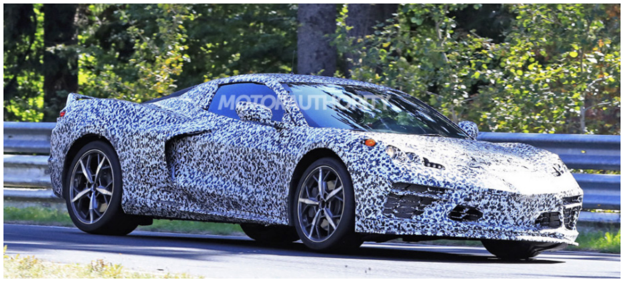
2020 Chevrolet Corvette (C8) spy shots

We've reached out to Chevy for clarification and will update this post when we hear back.