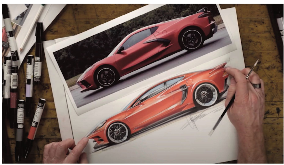
Chip Foose draws the Chevrolet Corvette C8

A mid-engine layout brings significant performance benefits, which helped the C8 win Motor Authority's Best Car To Buy award, but it also erased the Corvette's heritage, according to Foose, who believes the C8 is too generic looking, and too easily confused with other mid-engine cars like the Acura NSX.