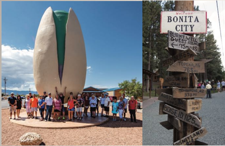
2017 New Mexico Trip