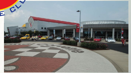
2013 Cruising to the National Corvette Museum, Bowling Green, Kentucky