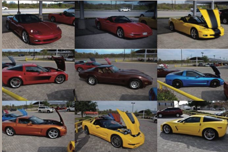
2009 Displayed BRCC Cars at Classic Chevrolet Car Show. First time Sharon & I were introduced to BRCC.

I could only go back to 2009 for pictures. Before that we used ZenPhoto, pictures have since been deleted by ZenPhoto. I've taken & saved over 24,000 pictures from different events. Here are just a few of the memorable events.