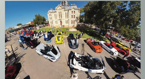
2023 Huge turn out for our BRCC Annual Car Show.