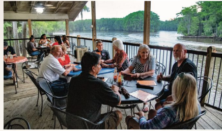
2019 Jefferson - Brenham, Caddo Lake