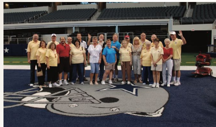
2011 Cowboys Stadium