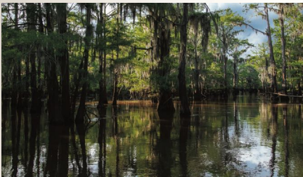
2019 Jefferson - Brenham, Caddo Lake