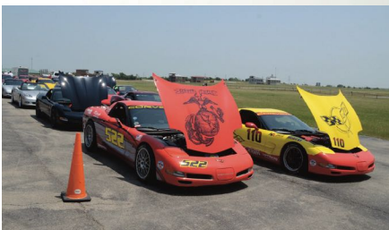
2012 Track Day Motor Sports Ranch