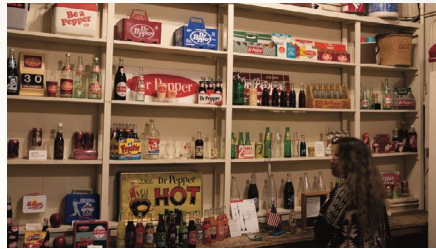
2020 Doblin Bottling Plant