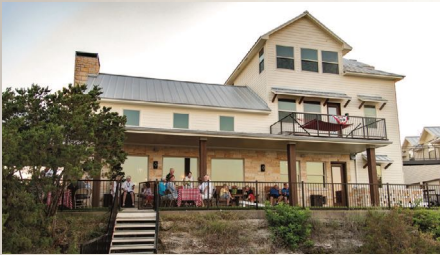
2018 Lawsons 1st Annual BRCC party