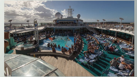
2014 BRCC Jewel of the Sea Cruise