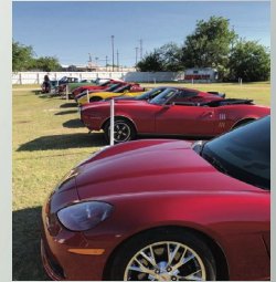
2022 Drive-in-movie time