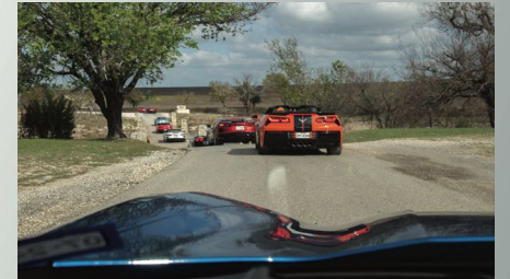
2023 Rough Creek Cruise