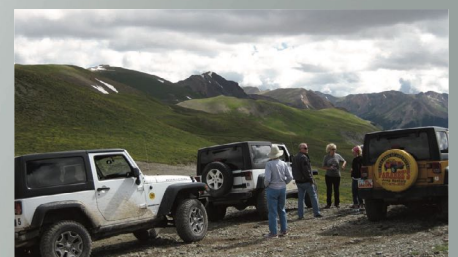
2015 Colorado Trip - Parked our Vets rented Jeeps to drive up the Mountains