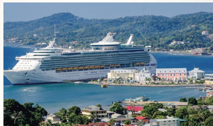
2012 BRCC 2nd Caribbean Cruise