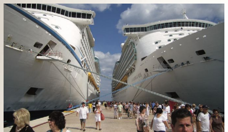
2011 BRCC 1st Caribbean Cruise