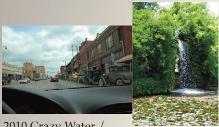
2010 Crazy Water / Clark Gardens cruise