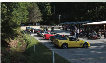
2013 Tail of the Dragon at Deals Gap, NC