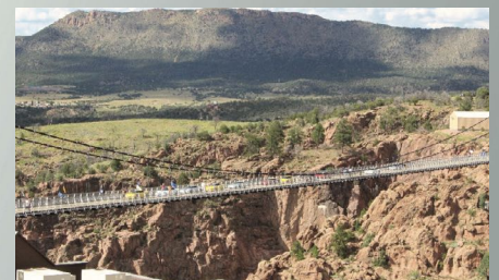
2015 Colorado Trip, Royal George. BRCC cars on the bridge.