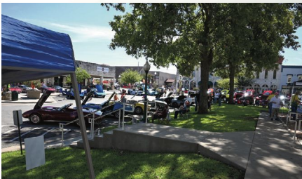
2021 Car Show