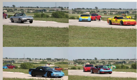
2011 Track Day Texas Motor Speedway