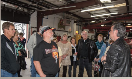
2015 Gas Monkey Garage