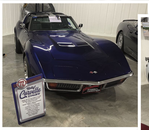
1972 Blu Ray Stringray BS