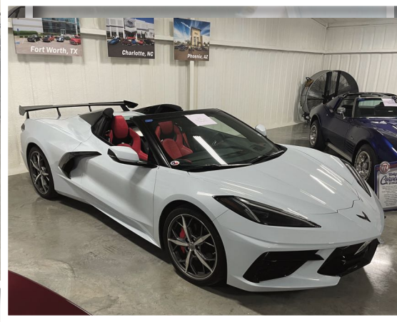
2022 Convetable BS