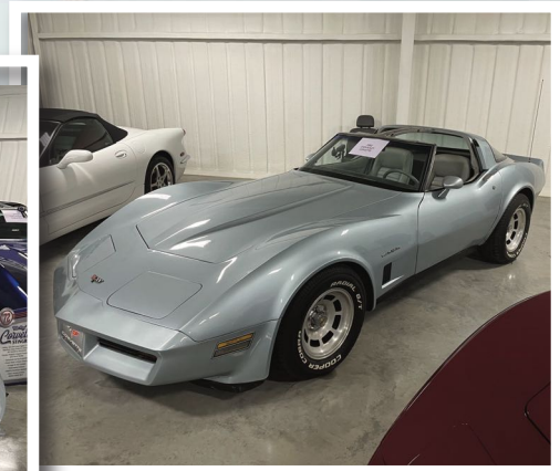
1982 Coupe BS