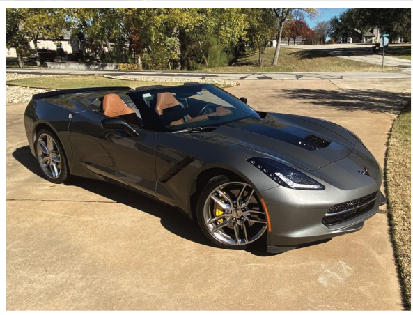
2015 Z51 LT3 Convertable GS