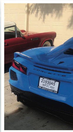
2021 HTC & 65 Fuelie Convertable with ground up 3 year restoration added vintage air and power steering. BR